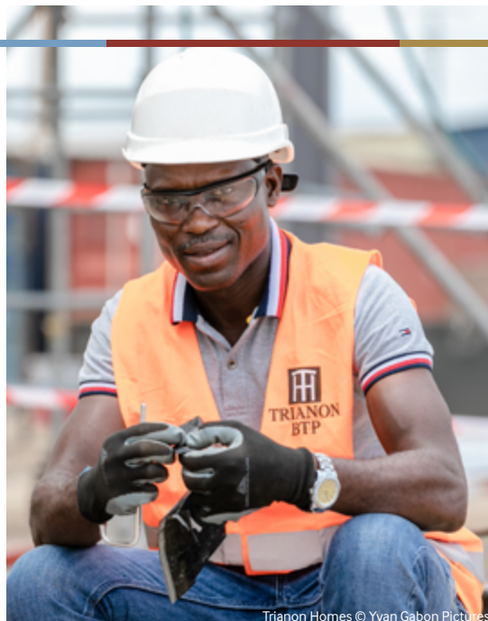
Trianon Homes

For instance, we aim at setting up energy efficient systems in order to reduce production costs as well as our carbon footprint. We are committed to improving work conditions for employees (health coverage, work safety, etc.)