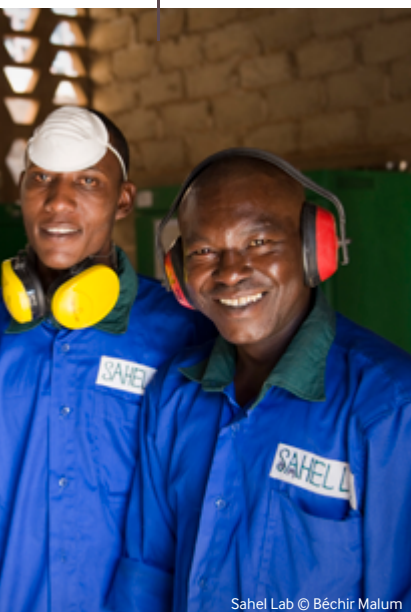
Sahel Lab

Objective: Providing strategic support to entrepreneurship support structures (incubators, accelerators, etc.) in the program's target countries.